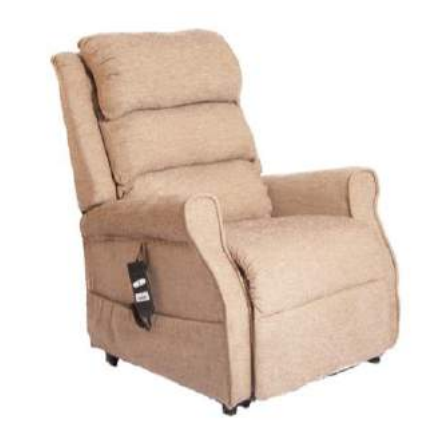
STANDARD SEATING POSTION

The chair has a range of electrically operated adjustments that can be operated using the control handset, specifically as shown below: