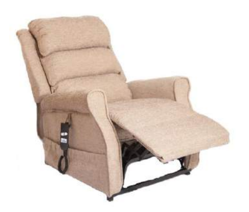
LEGREST ELEVATION POSTION