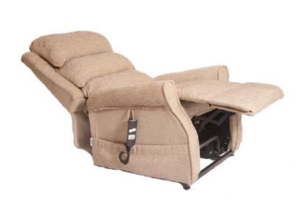
FULL RELCINE POSTION